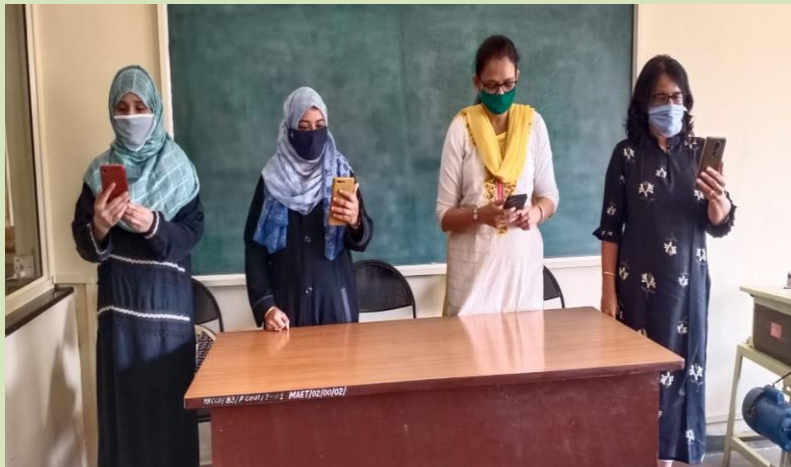
College Staff and Students are taking online Pledge