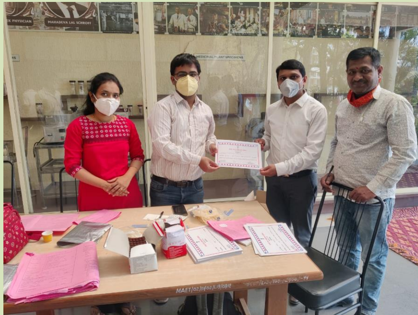
Blood Donation Camp at YBCCPA