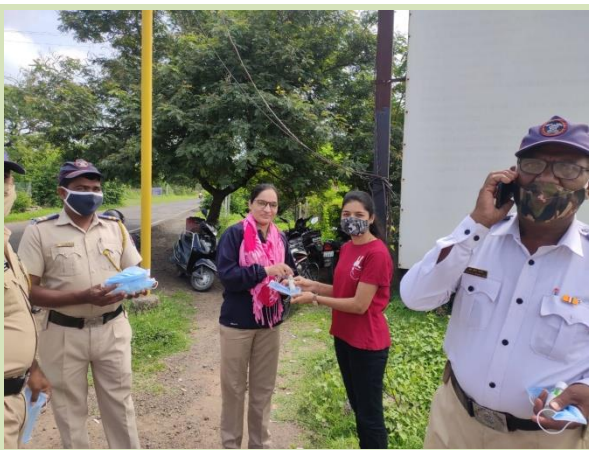
“Free Mask and Sanitizer Distribution to Police”