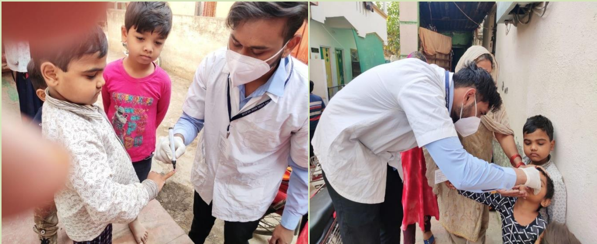
NSSs volunteers in One week Polio Drive in Aurangabad City